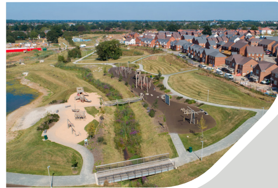
Myton Green, Warwick