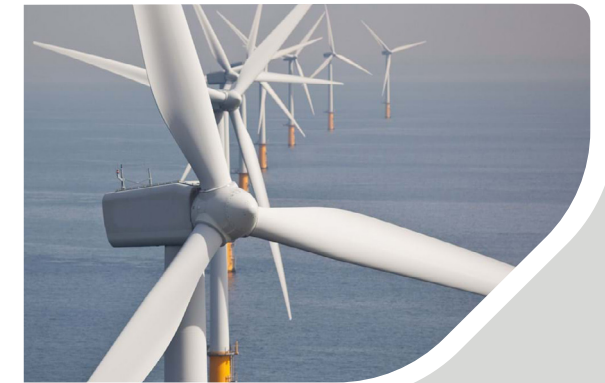
Race Bank offshore wind farm