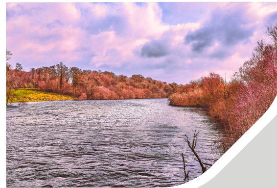
30 Causeway, Lakeside